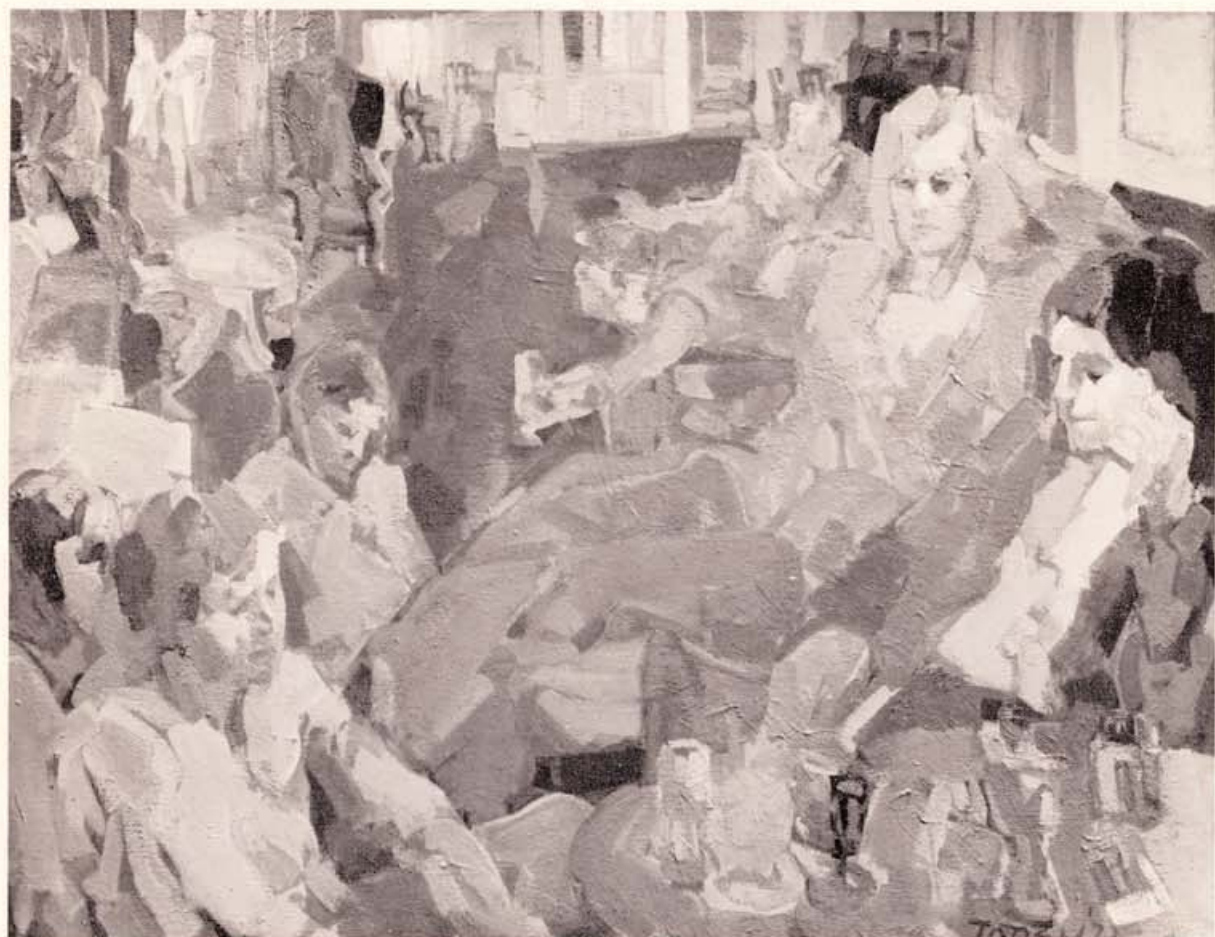
16. RED PARTY